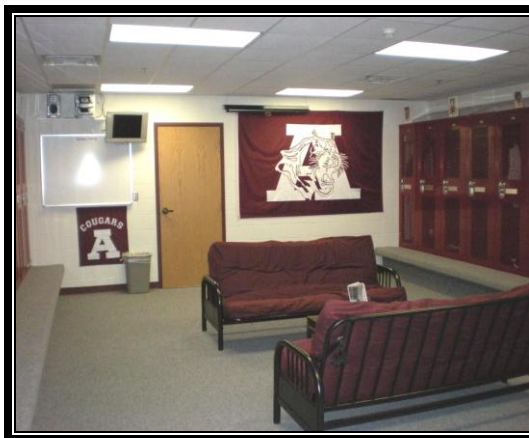
Men's Locker Room

Ada Cougar Activity Center (ACAC) is one of the nicest high school arenas in the state. This air-conditioned facility will serve as the main court during camp activities. Other facilities such as the PE Gym and Junior High Gym may also be utilized.